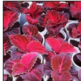
Tray of Coleus for sale