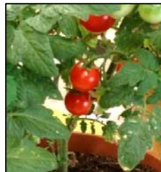
Club Cultivar Tomato