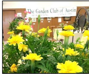
Club Cultivar Marigold