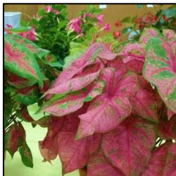
Caladium and Begonia