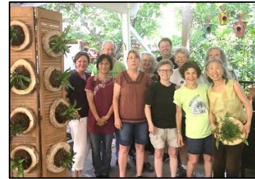
Making Fern Plaques for the sale