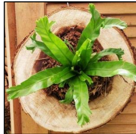
Fern Plaque for sale