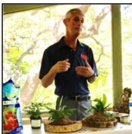
Talk on Fern Plaques